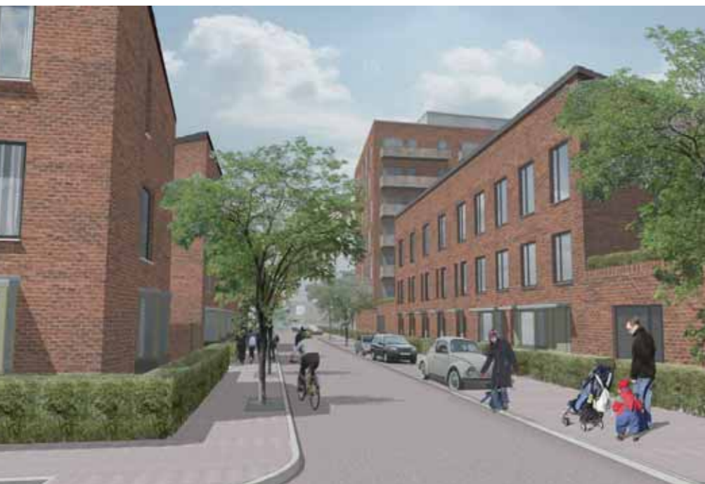
Exeter Road view – Macreanor Lavington Architects