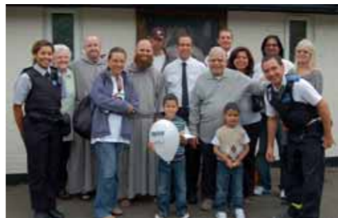
Top: The winner hands over £100 to be used at the Friar Benets Kitchen Above: The winner, his family, members and friends of the Friary and Canning Town South Safer Neighbourhood Team

The young man who released this balloon received a £20 book voucher as a prize. Whether it be through email, word of mouth or by balloon the message of safer neighbourhood policing is spreading.