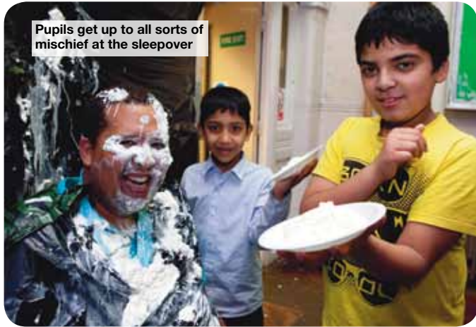
Pupils get up to all sorts of mischief at the sleepover