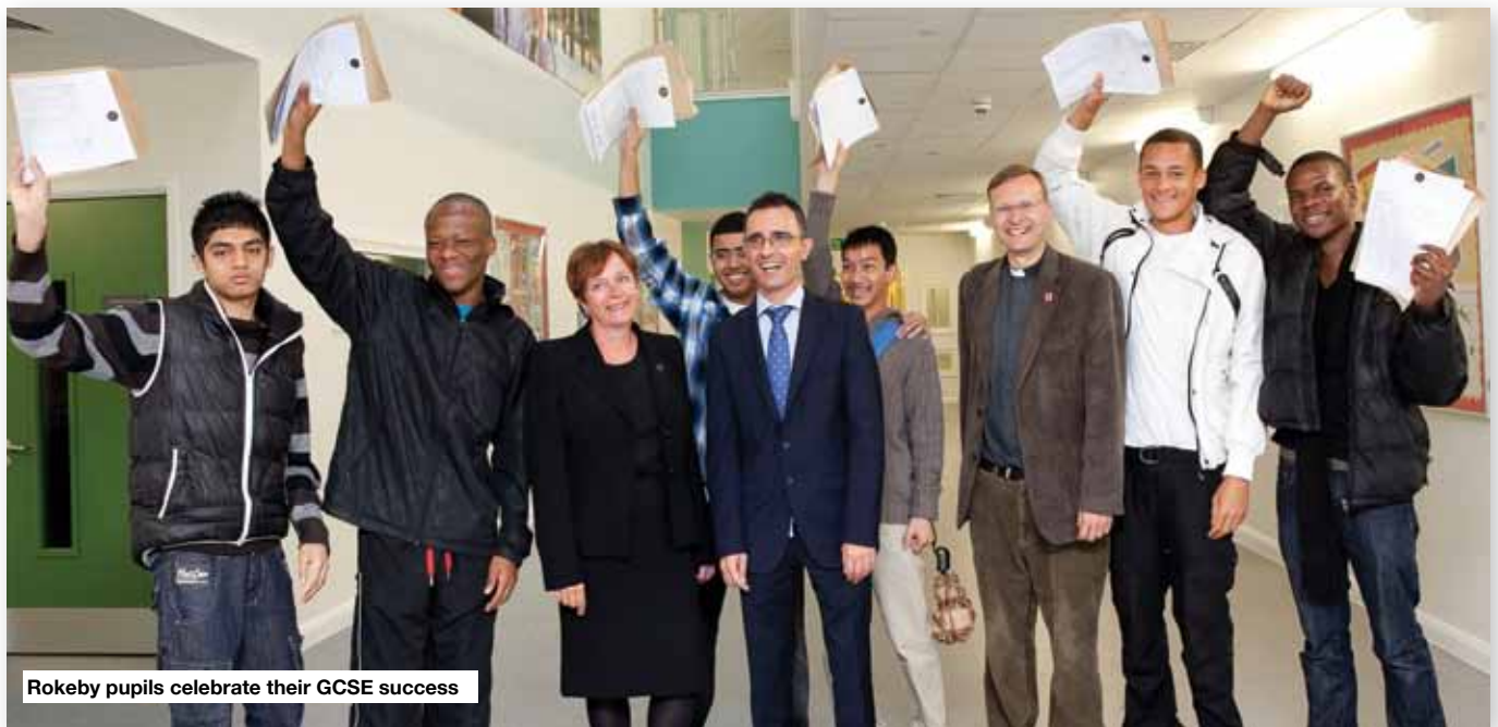
Rokeby pupils celebrate their GCSE success