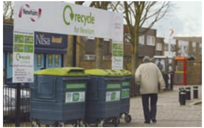
The recycling station in Freemasons Road

There are a number of ways in which people can recycle throughout Canning Town and Custom House.