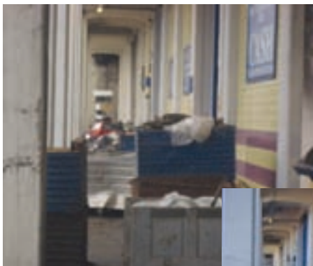
Before notice was served