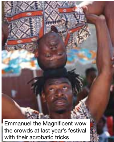
Emmanuel the Magnificent wow the crowds at last year's festival with their acrobatic tricks