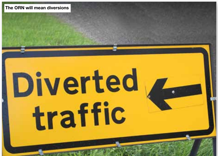
The ORN will mean diversions