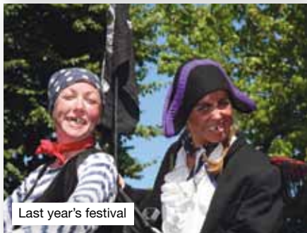
Last year's festival