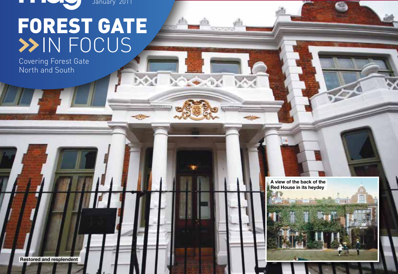
Restored and resplendent

A listed building in Upton Lane was saved from ruins when Newham Council stepped in and forced the owners to take action.