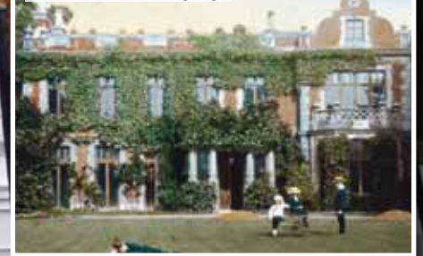
A view of the back of the Red House in its heyday

House included repairs to the brick and stonework, reinstatement of decorative elements, repairs to windows, doors and the plasterwork.