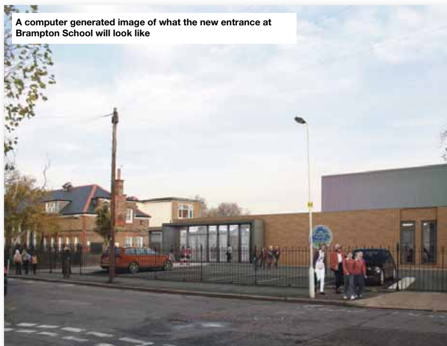
A computer generated image of what the new entrance at Brampton School will look like

The refurbishment of Brampton Primary School will include a new two-storey building which will house a learning resource centre and a staff area. A new administration building will be constructed and this will also be part of the new entrance to the school. In addition, a new double height sports hall with additional rooms will be built