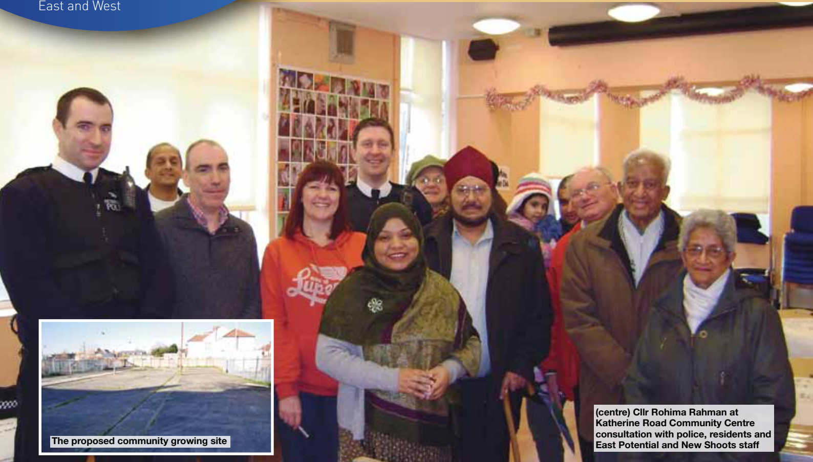
The proposed community growing site