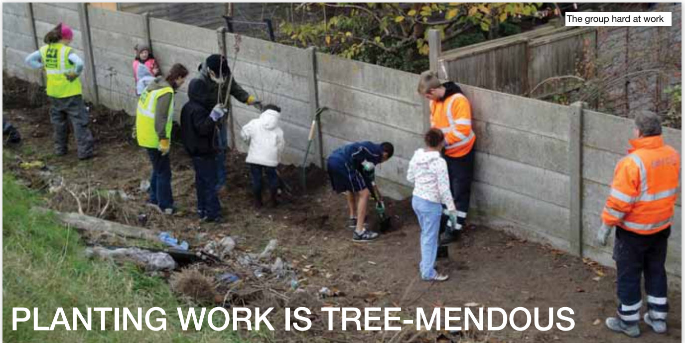
The group hard at work