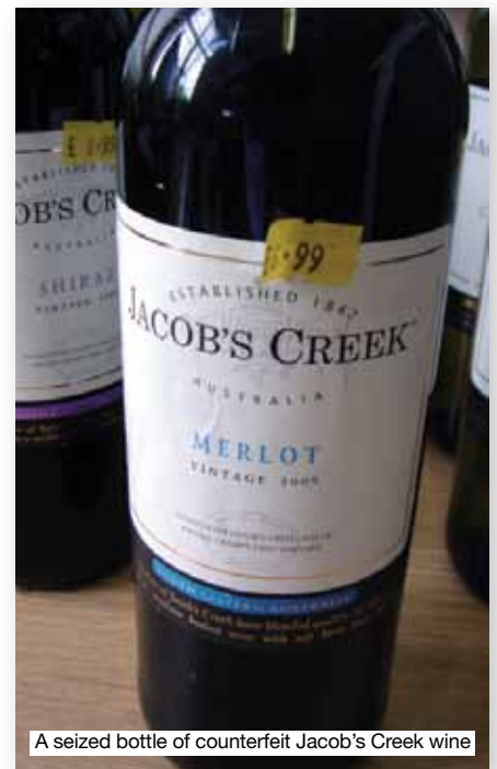
A seized bottle of counterfeit Jacob's Creek wine

People suspecting these items should contact Consumer Direct on 01622 626520 or www.consumerdirect.gov.uk