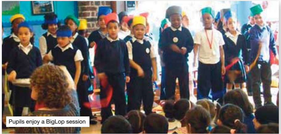
Pupils enjoy a BigLop session