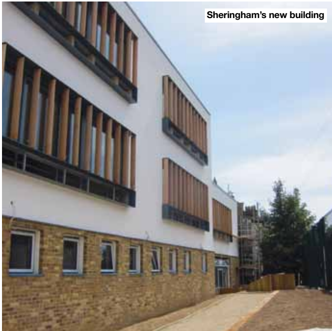
Sheringham's new building