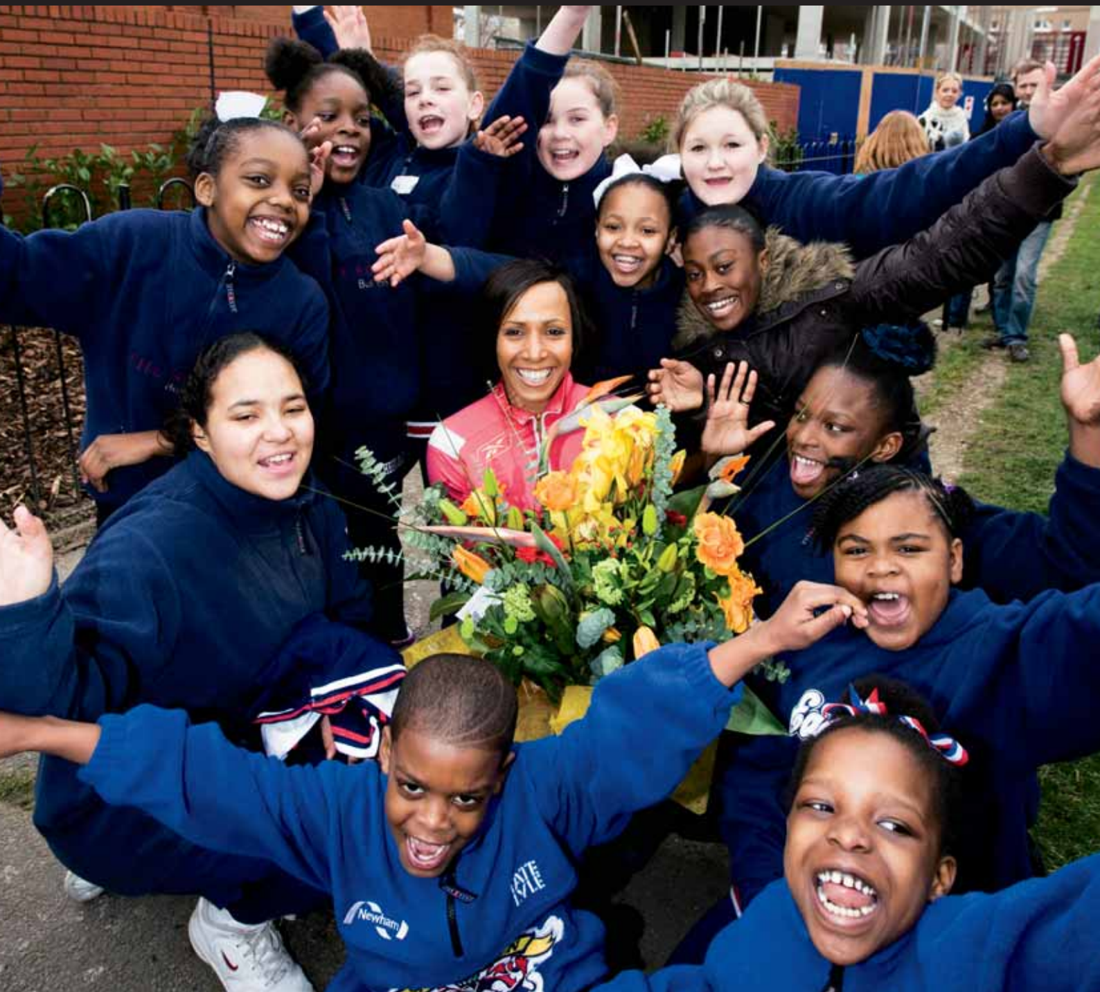
Above: Dame Kelly Holmes and friends in jubilant mood in Canning Town

LATEST REGENERATION NEWS FOR CANNING TOWN AND CUSTOM HOUSE RESIDENTS