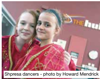
Shpresa dancers