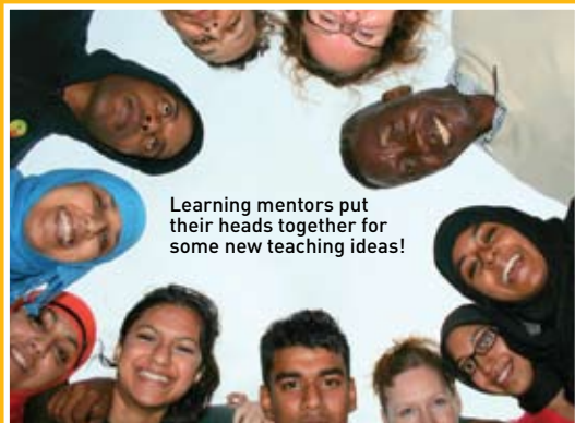
Learning mentors put their heads together for some new teaching ideas!

them to unlock their potential and fulfil their ambitions.