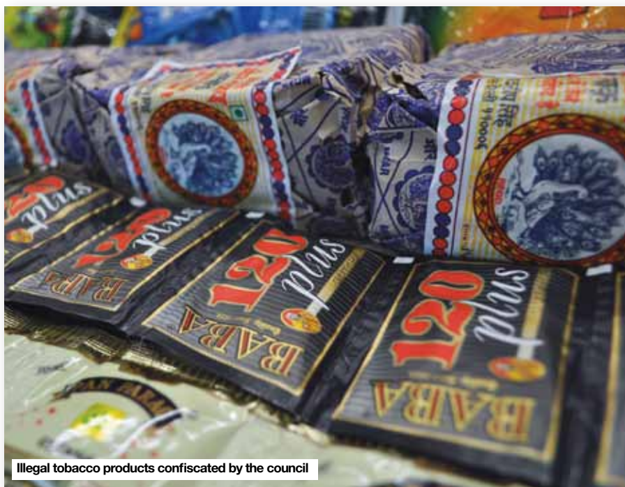
Illegal tobacco products confiscated by the council

These tobacco products are addictive, have higher concentrations of cancer-causing chemicals than in cigarettes and can cause mouth cancer. In addition, paan (a tobacco leaf-based mixture that when chewed creates a red liquid which is spat out) leaves a