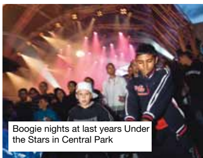
Boogie nights at last years Under the Stars in Central Park

To you give you a taster of what's on the menu for this summer here are some important dates.