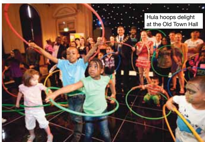
Hula hoops delight at the Old Town Hall