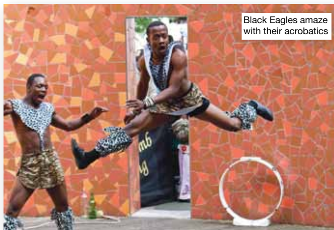
Black Eagles amaze with their acrobatics