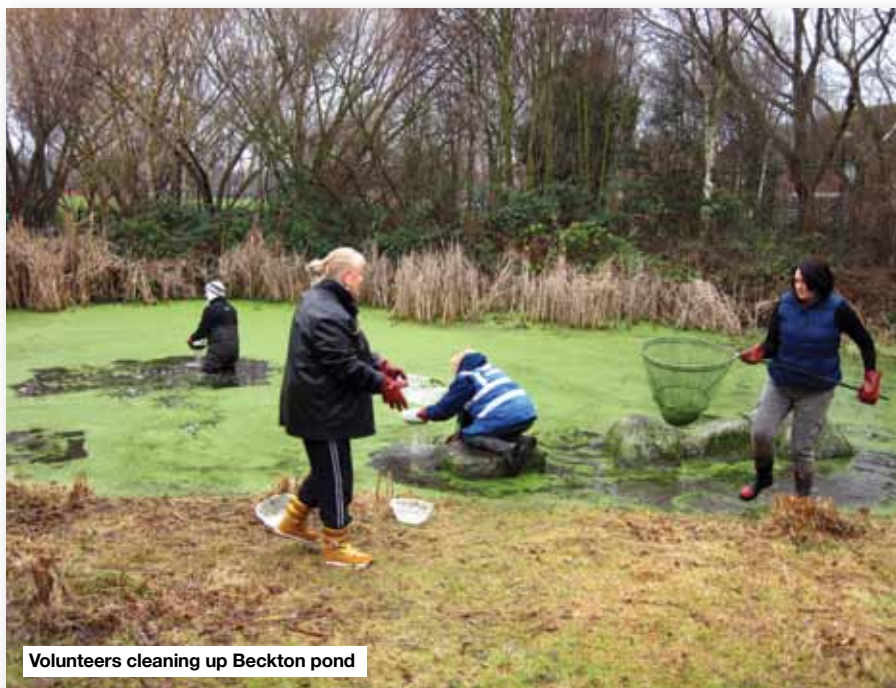
Volunteers cleaning up Beckton pond

skills to volunteer - you just need to be a pleasant, nice person, have a general interest in the wellbeing of the planet and like being outdoors. We're only tenants on this planet so we have to look after it.