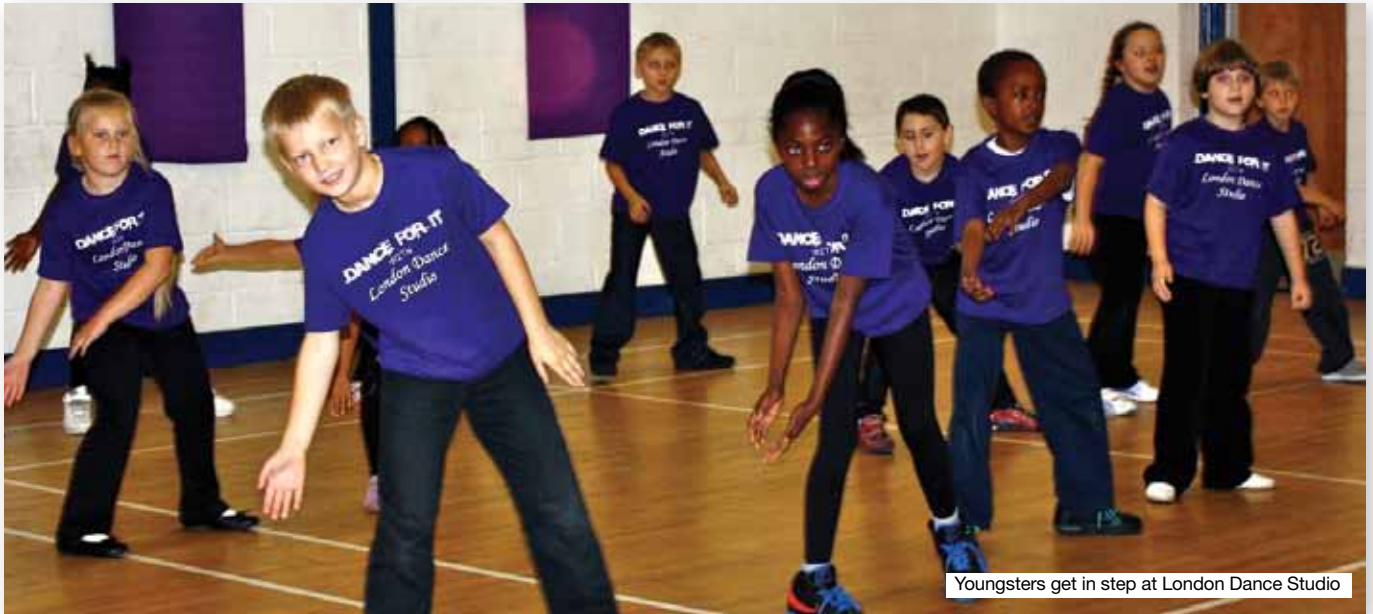
Youngsters get in step at London Dance Studio