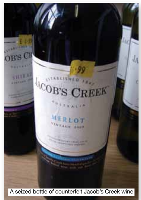
A seized bottle of counterfeit Jacob’s Creek wine

People suspecting these items should contact Consumer Direct on 01622 626520 or www.consumerdirect.gov.uk