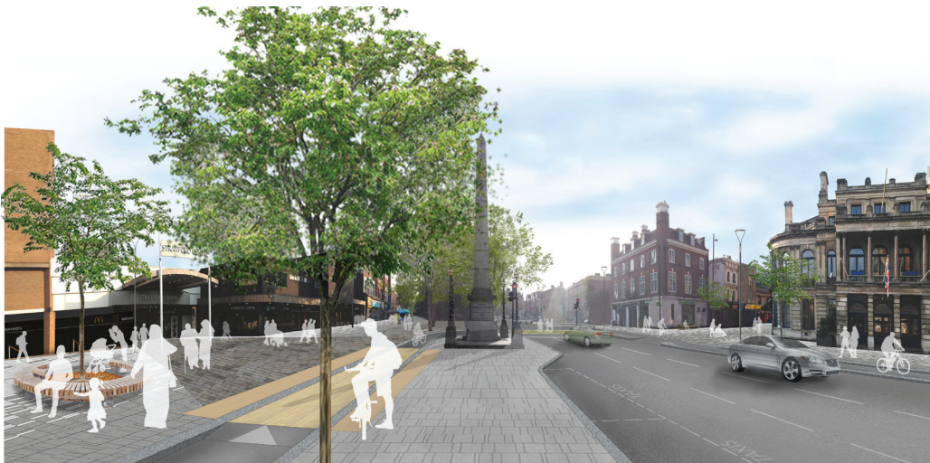
Artist's impression of proposals for the Broadway

During construction we will work closely with local businesses and residents to keep disruption as low as possible. We aim to complete our works by spring 2019.