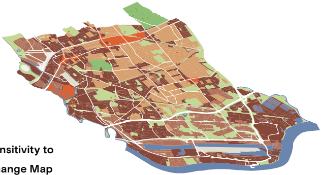
Sensitivity to Change Map