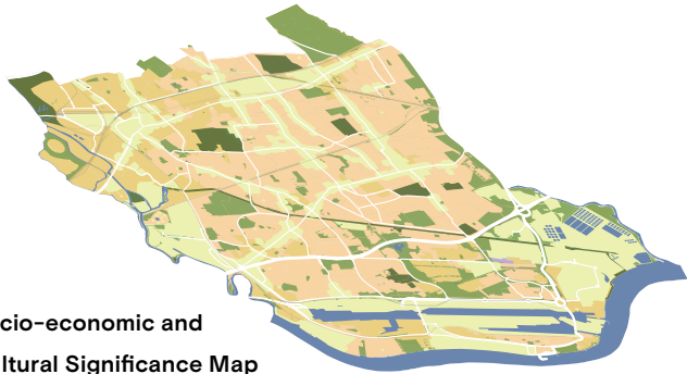
Socio-economic and Cultural Significance Map