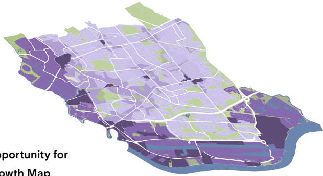
Opportunity for Growth Map