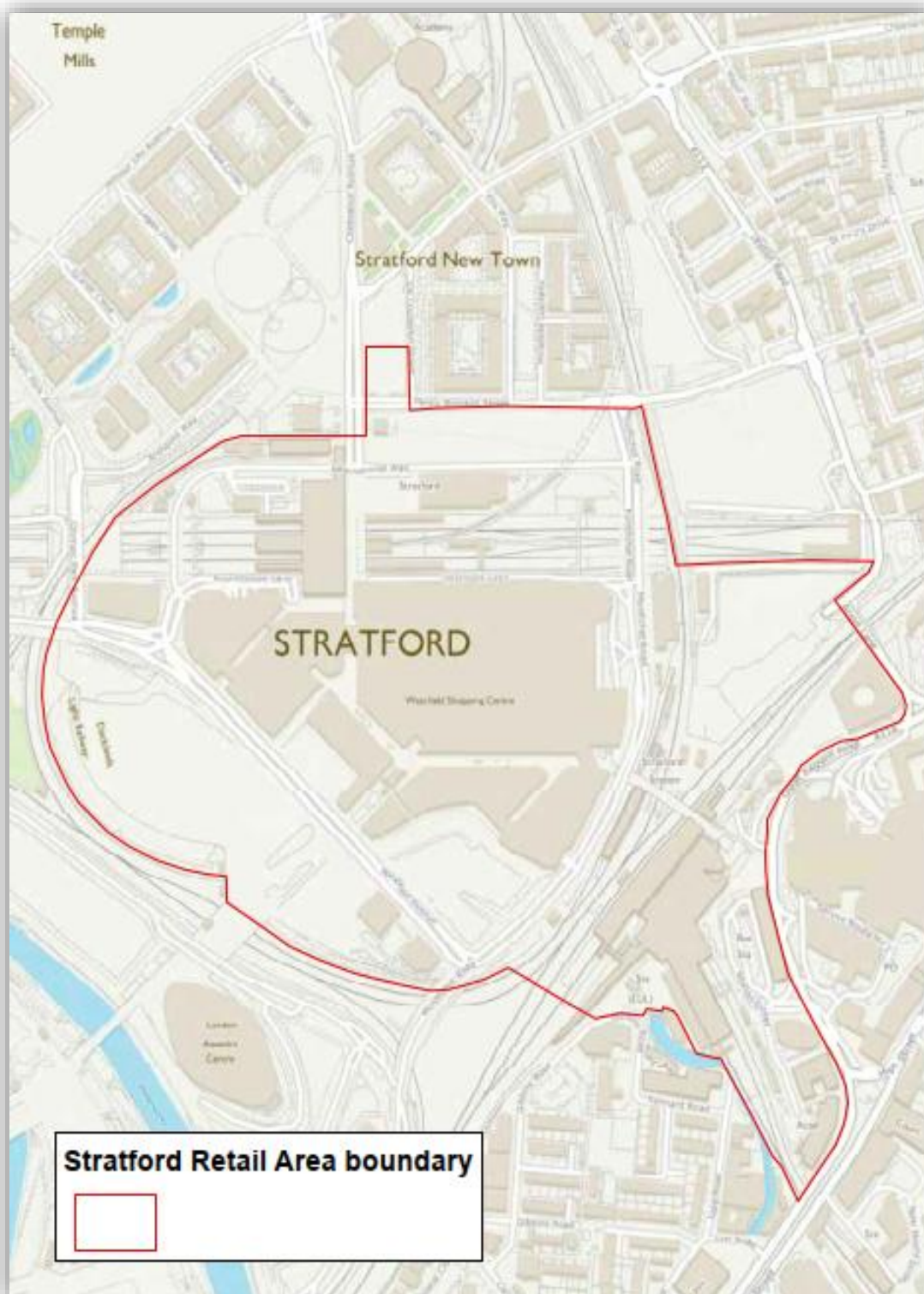
Figure 1 Stratford Retail Area Boundary