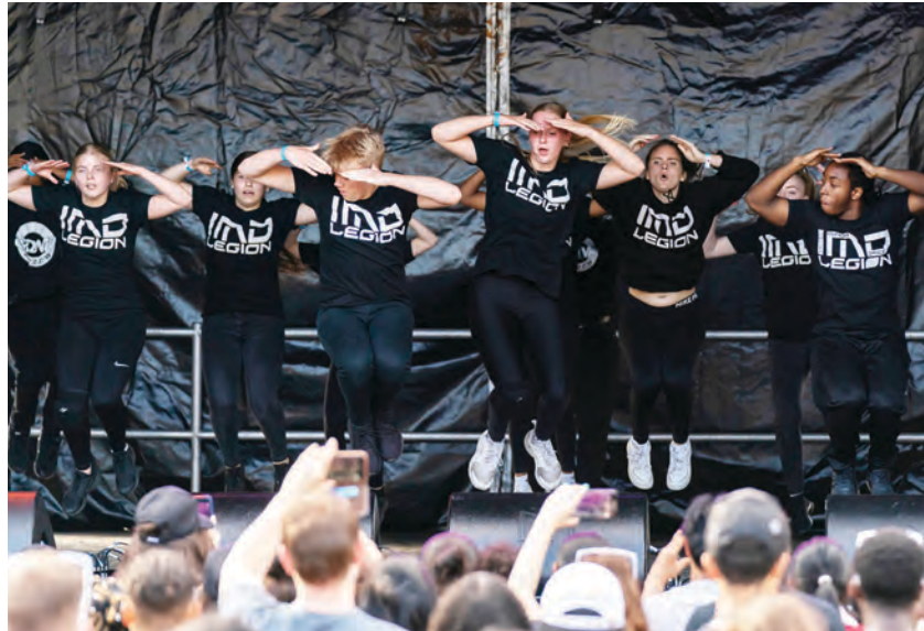
IMD Legion entertained young people at the Newham Show

setting up a task force to directly address the issue. With seven in every 100 deaths in Newham linked to poor air quality, our younger generation is being put at risk by the behaviour of adults, so it's imperative urgent action is taken.