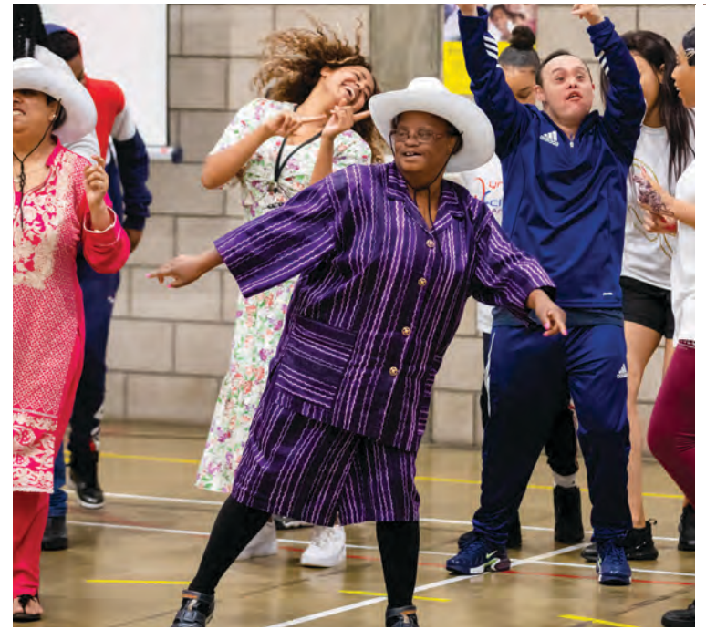
Forest Gate Youth Zone hosted the Can You Hear Us event