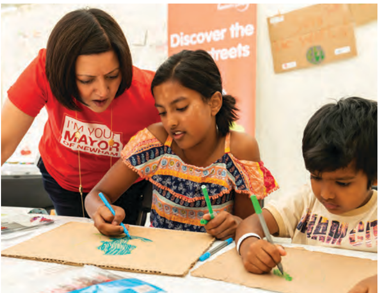
Children enjoyed getting crafty at the Newham Show