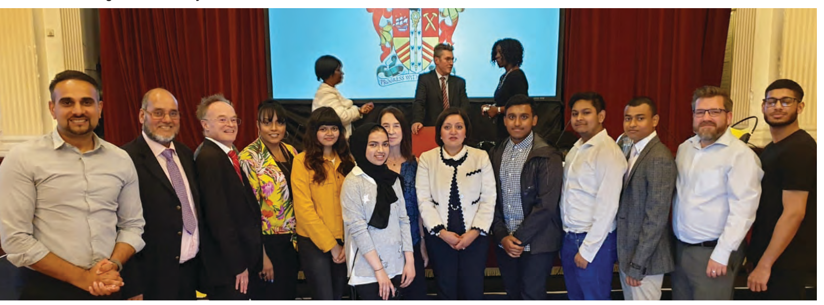
Meeting young people concerned about climate change