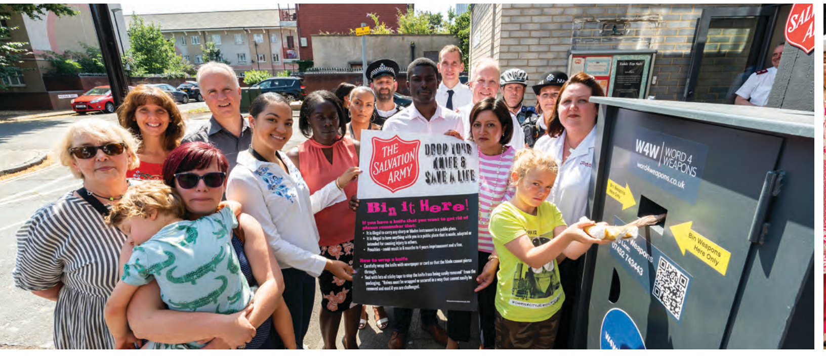
Launching the knife amnesty bin in Stratford