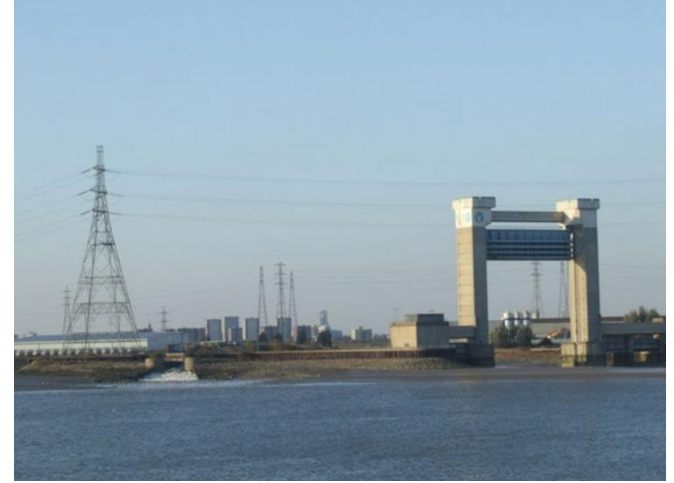
Source: Canoe London<sup>11</sup> <u>http://canoelondon.com/river-roding/</u>