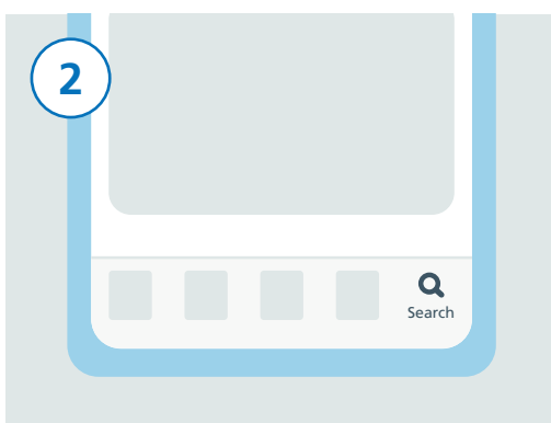
At the bottom of the screen, find the "Search" icon and tap on it.