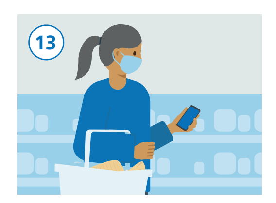
You can use your phone as normal, however make sure to keep the app running in the background and Bluetooth turned on. The app will not track your location.