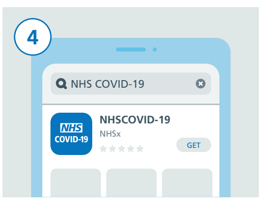
There will be a list of results of different COVID-19 apps. Find one that says "NHSCOVID-19" and tap on it, then tap the "GET" button.