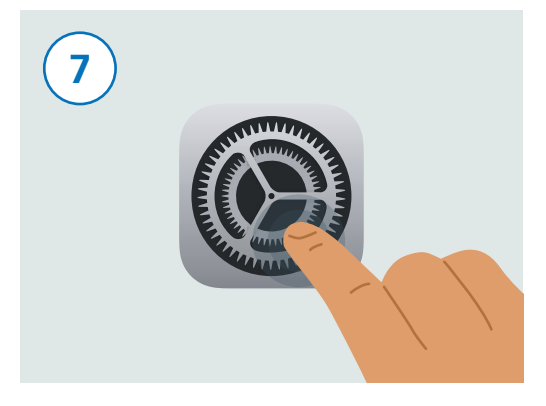
Now it's time to switch on Bluetooth so that the app can work. To do this, first find the "Settings" app and tap it.