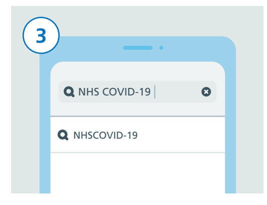
Tap on the search bar. Type in "NHS COVID-19". You can now see a list of results below the box. Tap on a result with the name "NHSCOVID-19".