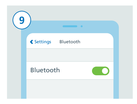
Switch Bluetooth on by tapping the slider on the right.