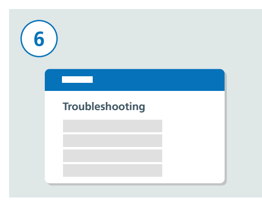
If this has not worked, visit "Trouble-shooting" on the NHS Test and Trace website www.covid19.nhs.uk for guidance that will help.