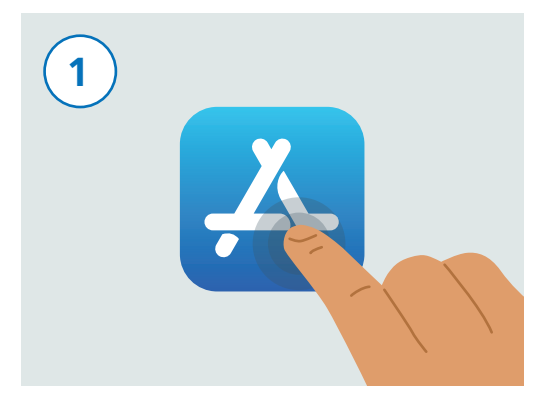
Unlock your phone. Scroll through your phone to find an app called "App Store". The app looks like the image above. Tap on it to launch it.