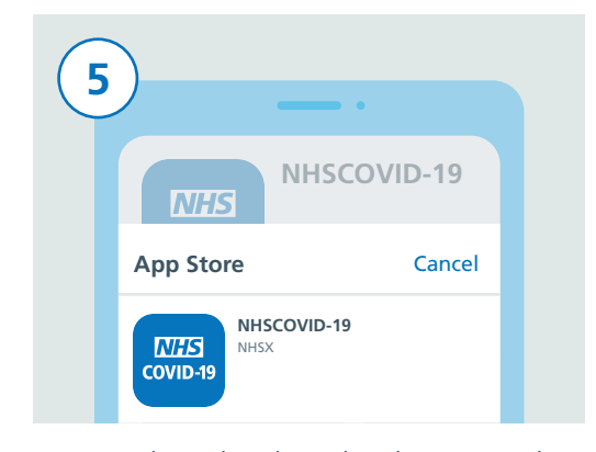
To complete the download you may be asked to type in your Apple ID details or to use your fingerprint or face verification if you have these set up.