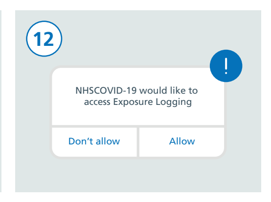
Follow the steps to finish setting-up the app. This includes allowing "Exposure Logging" which is used to identify whether you are at risk.