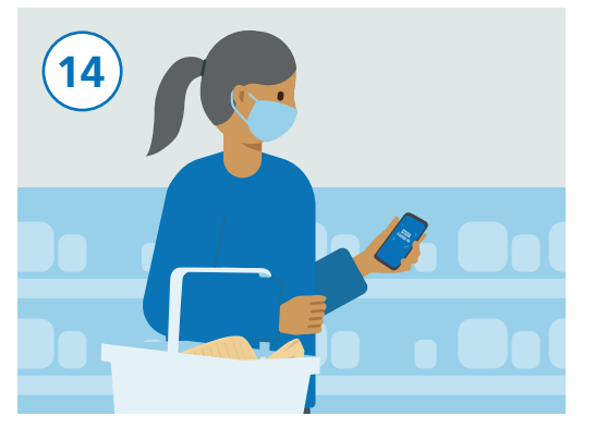
You can use your phone as normal, however make sure to keep the app running in the background and Bluetooth turned on. The app will not track your location.