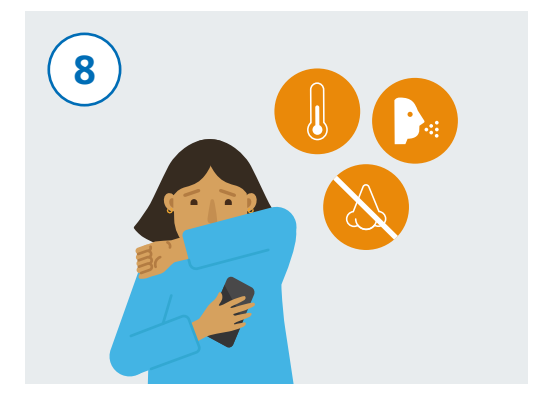
If you develop coranavirus (COVID-19) symptoms, make sure to record them in the app and follow Government guidelines/advice.