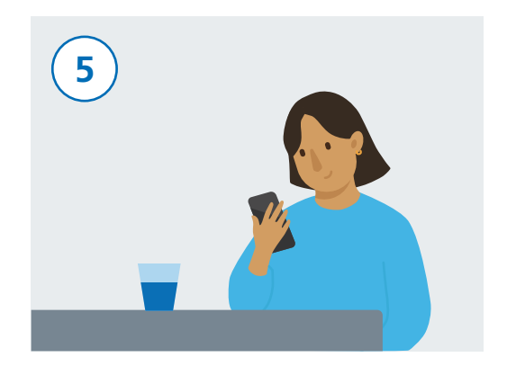
After scanning your QR code on the poster, you are now successfully checked in.