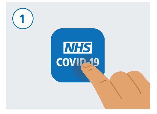
Download the NHS Test and Trace app from the App Store or Google Play Store.