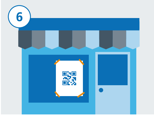
If you go to another venue, open your NHS Test and Trace app and tap "Venue Check In". Now use your smartphone camera to scan their QR code poster.