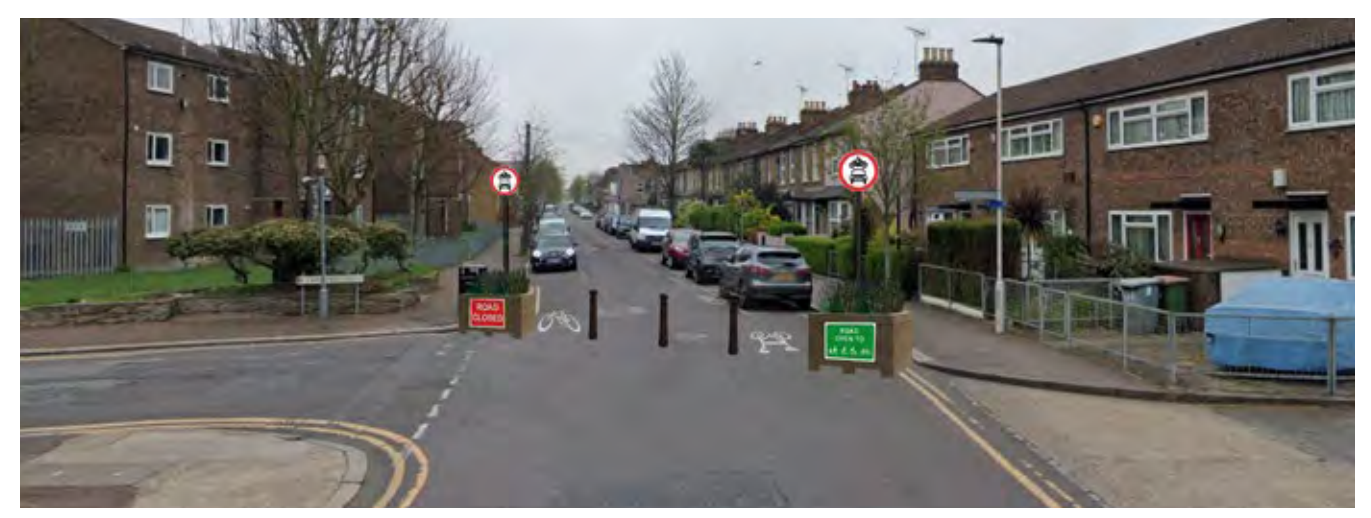
Indicative location of one of the modal filters on Odessa Rd, looking north towards Waltham Forest.