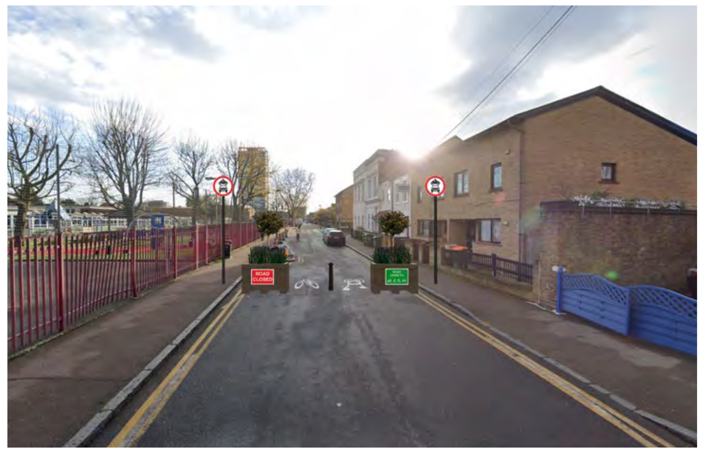
Indicative location of the modal filter on Maryland Rd, next to Colegrave Primary School.