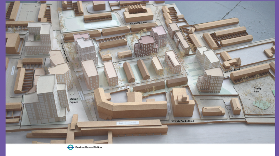
Custom House Masterplan Phase 1