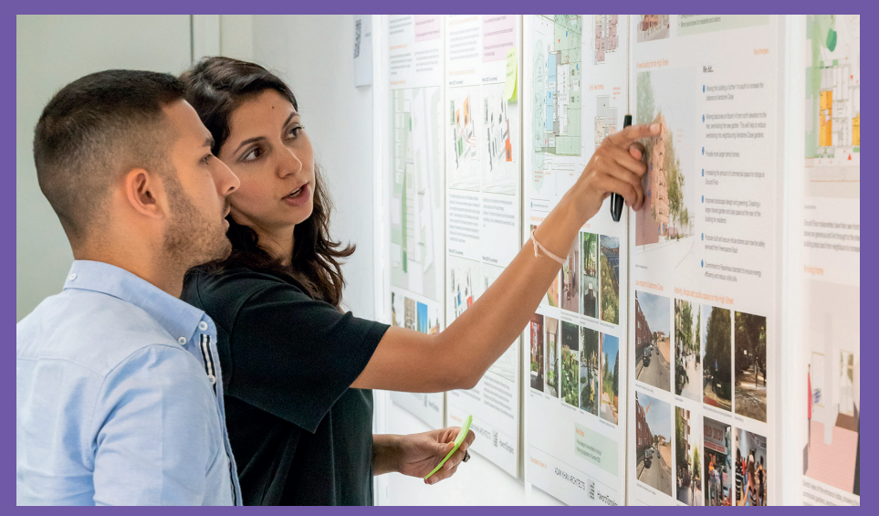
One of May's consultation events