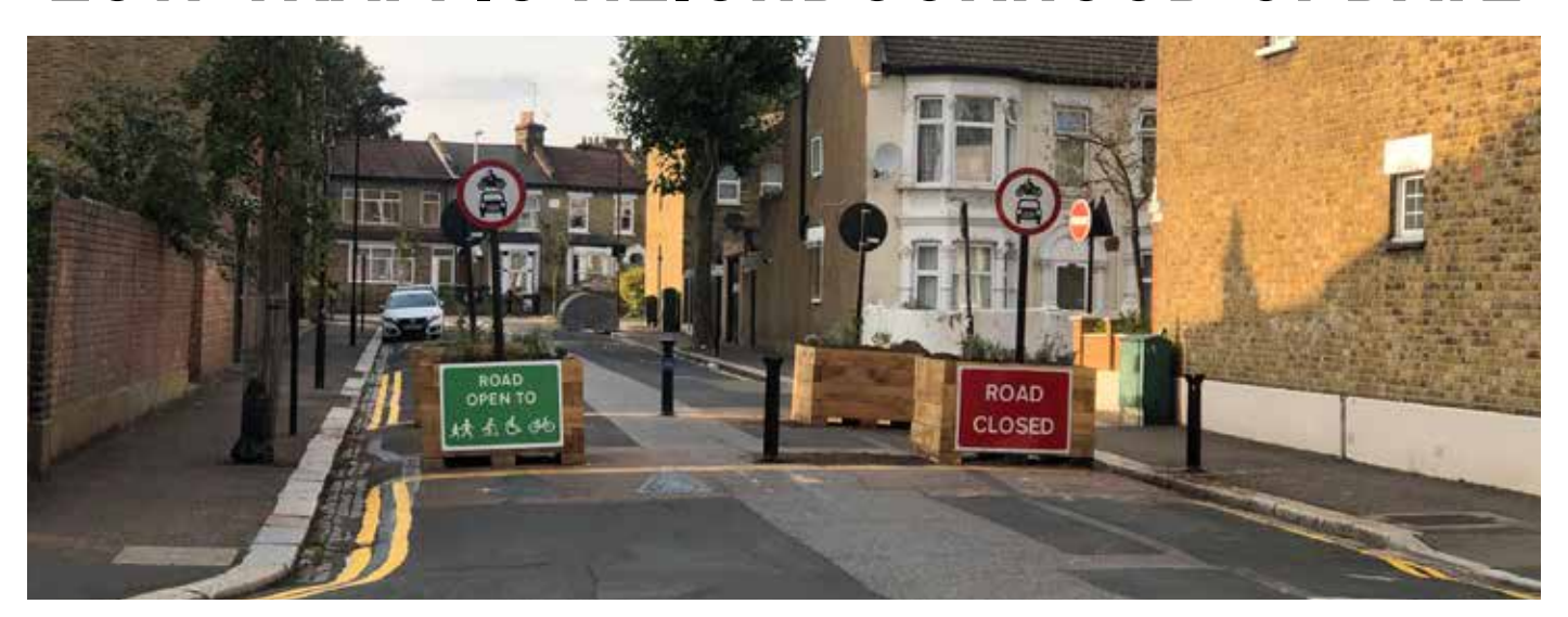
Modal filter on Blenheim Rd