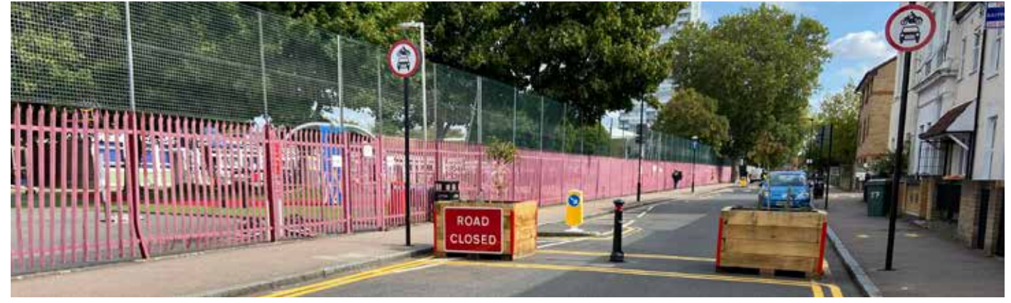
Modal filter on Maryland Rd, outside Colegrave Primary School