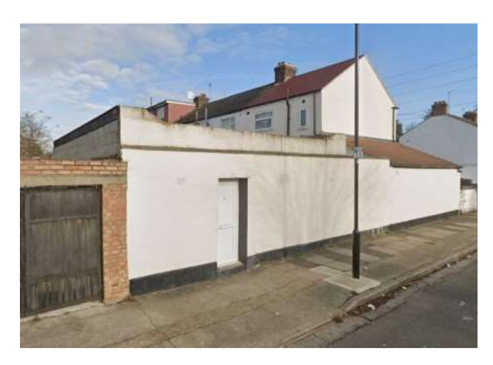
The image above shows the property with a poor EPC rating of G.

Find out more about the Minimum Energy Efficiency standards at <a href="https://www.newham.gov.uk/housing-homes-homelessness/minimum-energy-efficiency-standards-mees">https://www.newham.gov.uk/housing-homes-homelessness/minimum-energy-efficiency-standards-mees</a>