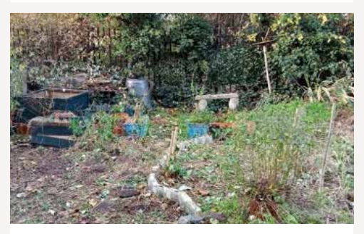
E6 Community Allotments

This project is delivering a sports and football programme to young people aged 14-18 in Beckton and Royal Docks.