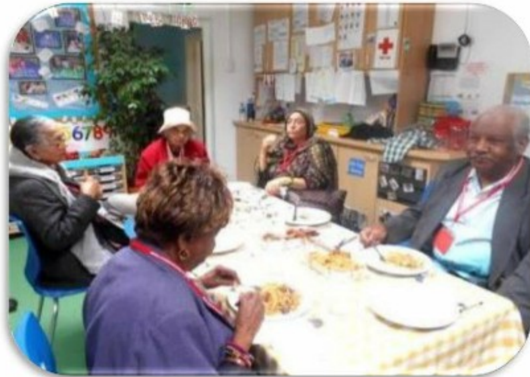
Adopt your neighbour project