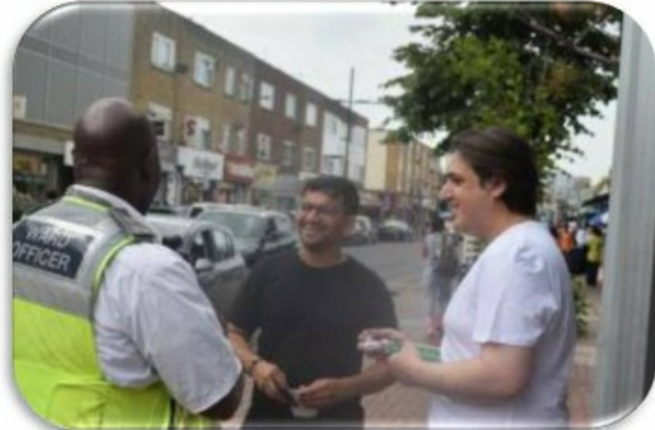
Priory Park 1st August 2019