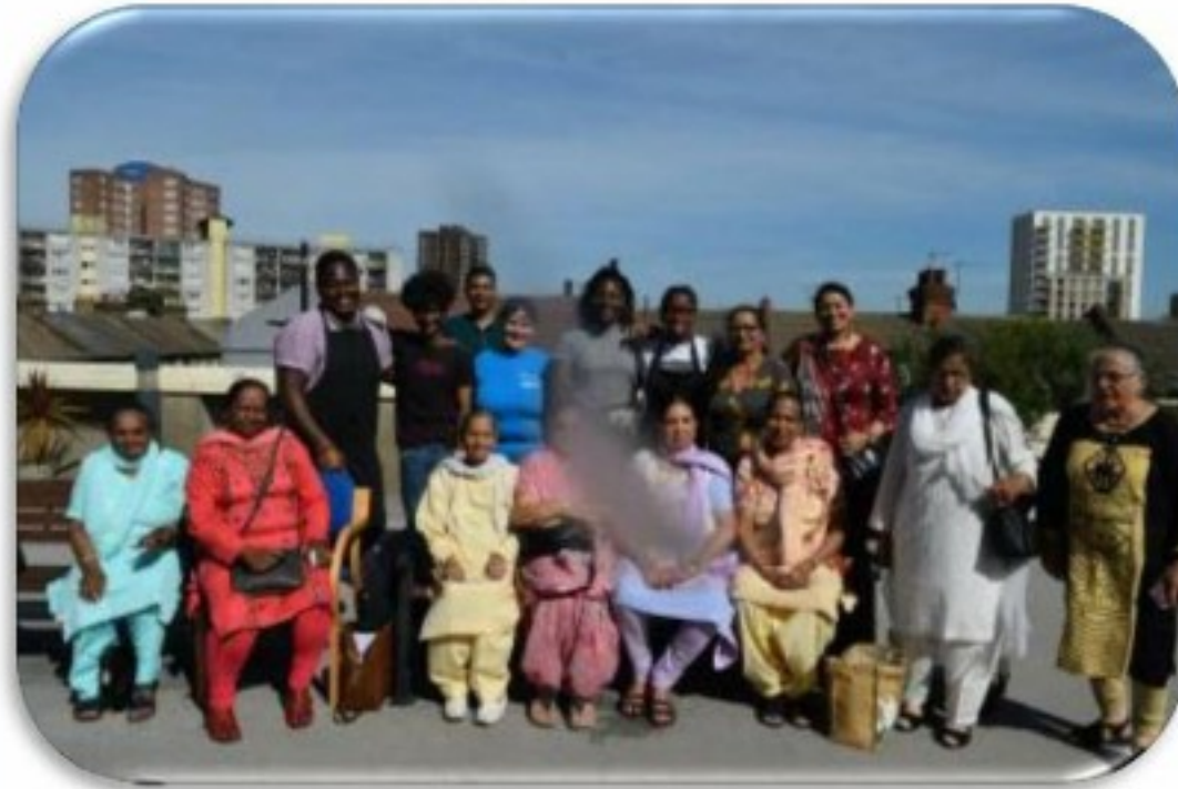
Summer BBQ at Hamara Ghar