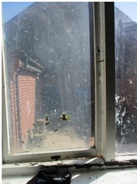
Image above: Ground floor rear kitchen showing casement window with Perspex glazing

Newham Council believes that no family should have to endure such deplorable living conditions and the council will take firm action against landlords who fail to provide safe and legal accommodation for their tenants.